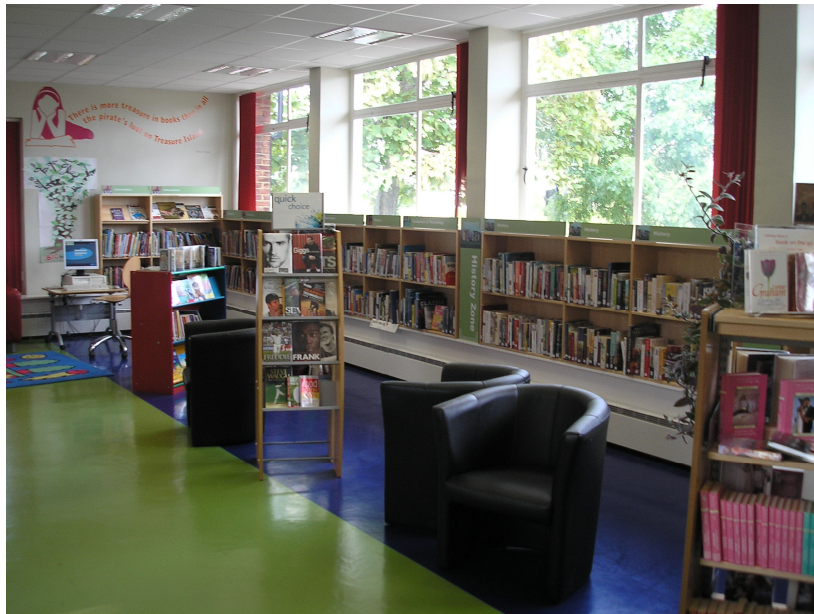
Coldharbour Library, Gravesend